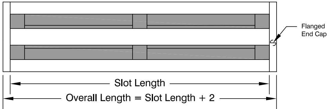
DRYWALL OPENING FOR EXPOSED FLANGE AIR BAR WITH FLANGED END CAPS