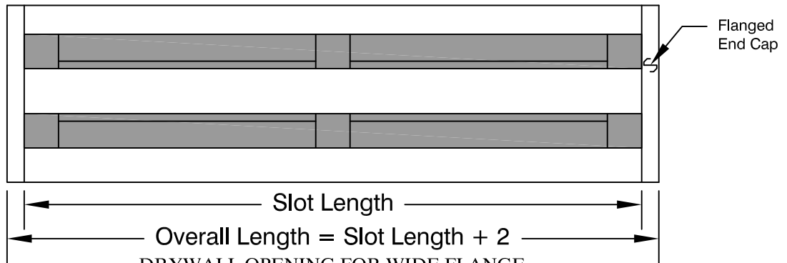
DRYWALL OPENING FOR WIDE FLANGE AIR BAR WITH FLANGED END CAPS